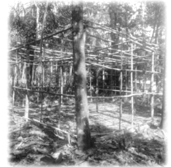
Site of the new church

(Even though this is not about a real boy named Jaku, everything in this story is true. Parts were written by someone who has been there and is going back to stay and tell the indigenous people about Jesus.)